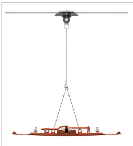
On the cross span (steel or synthetic rope)

For further recommendations see our assembly instructions. The suspension must be ordered separately to the KUDISC.