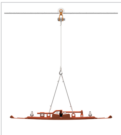
On the messenger cable